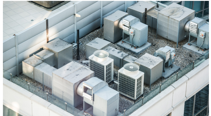
Don't leave roof-mounted HVAC systems exposed to severe weather without proper protection.

For more information on attachment of roof-mounted mechanical equipment, please refer to FEMA's " USVI-RA2 Attachment of Rooftop Equipment in High-Wind Regions. "