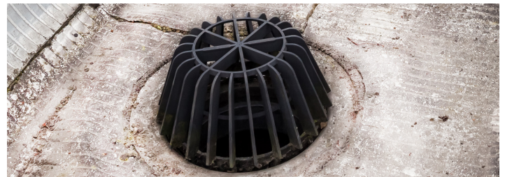
Keeping roof drains clear of debris (shown above) allows for proper drainage during severe winter weather, preventing water damage.